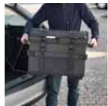
Two side handles