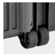
4 robust self-oiling wheels