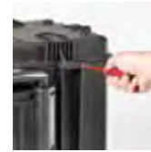
Removable upper lid