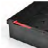
Stop-in-open position drawers system