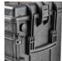
Automatic pressure release valve