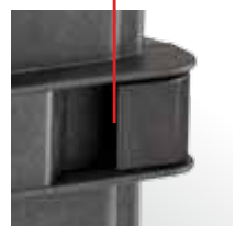
4 front door latches