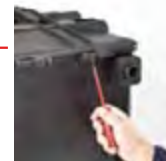
Removable frontal lid