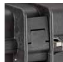
4 top lid latches