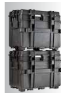
Ability to stack