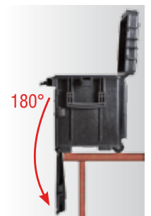
180° Front lid can be opened up to 180°