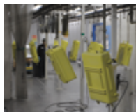
PAINTING & POWDERCOATING