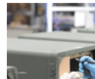
STANDARD & CUSTOM ASSEMBLY