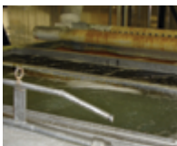
ALUMINUM AND METAL ANODIZING