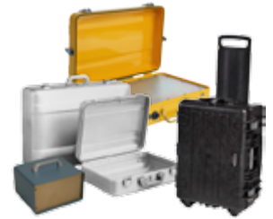
CARRY & INSTRUMENT CASES