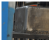
DEEP DRAWN ALUMINUM