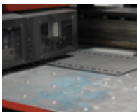
TRUMPF TRUPUNCH PRESS