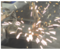
ALUMINUM LASER CUTTING