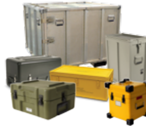
TRANSIT & STORAGE CONTAINERS