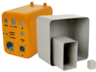
DEEP DRAWN HOUSINGS & VALUE ADDED PROCESSES