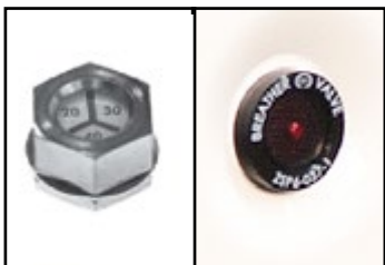
Humidity Indicator Auto Pressure Relief Valve

Sliding Shelf is made of quality steel for strength and allows sliding of equipment out of the case for more convenient access to controls or connections.