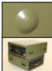
Concave & Convex Stacking Dimples

Matching Stacking Dimples mate with case surface to reduce sliding, to protect the case underside from ground and floor surfaces, and allow multiple configurations—vertical and 90 degree options.